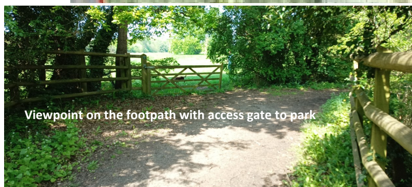
Viewpoint on the footpath with access gate to park